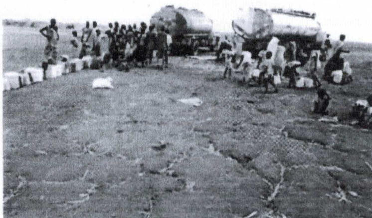
South Sudan refugees queuing for aid in Sudan